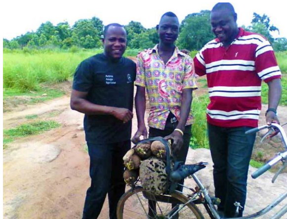
Two Cinevan evangelists chatting up a farmer on his way back from farm and inviting him to a film show.

31. CINEVAN TOWN SPONSORS: Pray for donors to sponsor the operation of our fleet of three Cinevans which are 12, 9 and 5 years old respectively. It costs $150.00 (or £115.00) for a Cinevan to visit a town or village at any given time to share the gospel, placing Bibles and Christian books in the hands of people living in these remote communities who do not have access to a Christian Bookshop. Pray with us for resources as we seek to replace the current ageing fleet of 3 and increase the total fleet to 5.